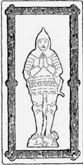
MACLEOD OF MACLEOD.

figure is here shewn as it probably appeared when complete, the restoration having been made from an incised slab at Creich in Fifeshire, dated 1400, the contour of the figure being very similar. It is remarkable that among the effigies