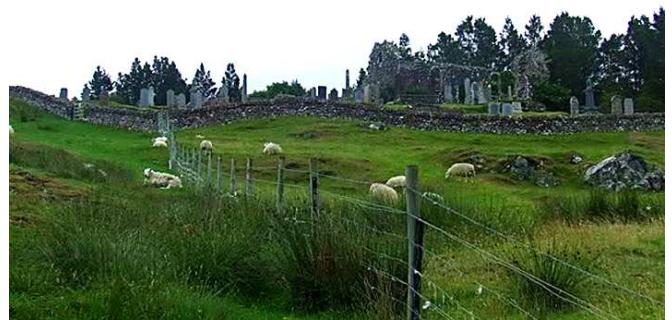
Kilchoan cemetery, Ardnamurchan.