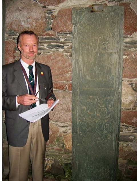
Slab 154/83. Attributed (by author) to the eponymous Ranald of Clanranald, d. 1386.

NOTE: Slab's very close similarity to 157/87 which I tentatively attribute to his father John I, d.1386. Both have a large foliated cross at the top, a small inscription panel near the centre and animals with plant scrolls at the bottom; only swap the galley for a sword. (see Ranald's inscribed cross shaft next page.)