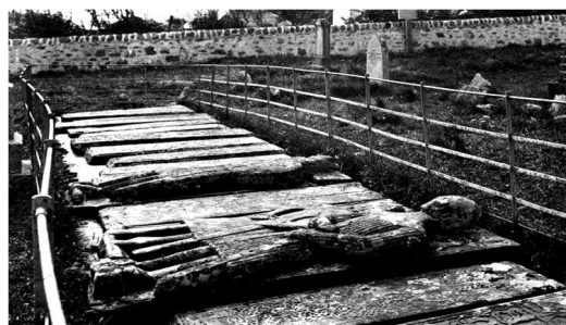
Left :- Slabs of Clan Chiefs, Iona, “ the best men of the Isles ” (re-arranged, fenced by the Iona Club, 1854-59).