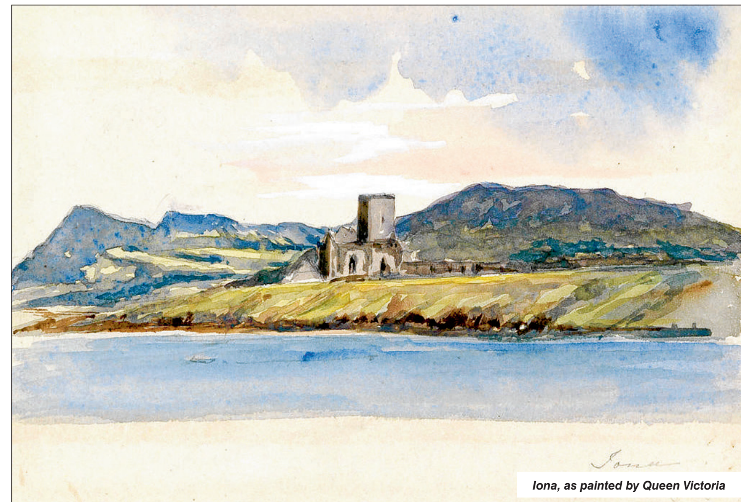
Iona, as painted by Queen Victoria

promised ten volumes but after the first was published the deal fell through with accusations levelled about political bias and historical bigotry going back to pre-Reformation days. An influential political fringe group maintained the 10th duke had been intimidated to renege on the deal by "establishment" interests who they believed wanted all Scottish history to be silenced.