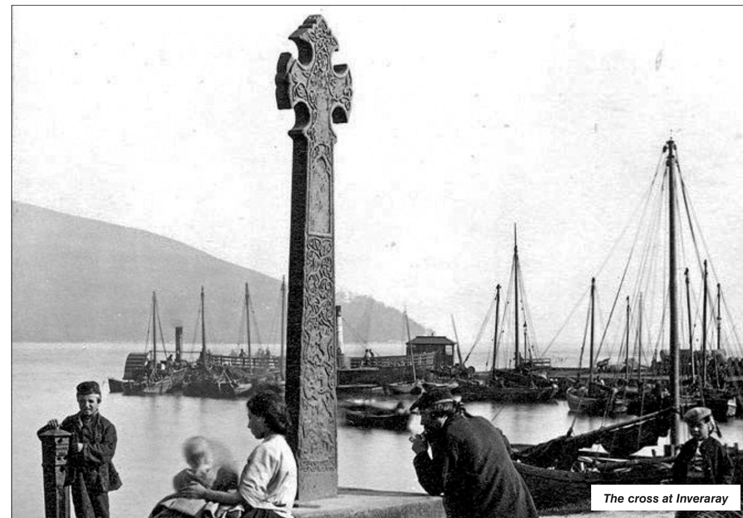
The cross at Inveraray

Red Hackle whisky tycoon Charles Heppburn put up the money for a