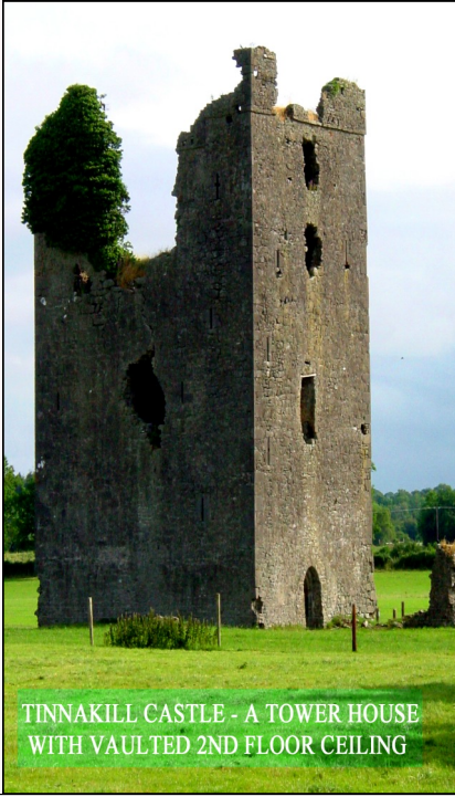
TINNAKILL CASTLE - A TOWER HOUSE WITH VAULTED 2ND FLOOR CEILING

COLONEL JAMES MACDONNELL, 10th of LEINSTER , d.1661, London. Patent from King Charles 1, 1637 as :- LORD OF THE MANOR AND CASTLE OF TIGH NA COILLE — TINNAKILL, QUEENS COUNTY : “ Its castellans of old derived from an illustrious and chivalrous race - whose Chiefs were styled “Lords of the Isles.” He was Burgess of “ Marriborough ”, capital of Leix-Queens-Laois County, and a member of the Assembly of Kilkenny Parliament. He was “ expulsed by the late usurpers ” in the 1641-51 Civil Wars (Three Kingdoms) having a huge £400 reward on his Confederate head. His line was finally deprived of the lawfully entitled estates in the Court of Claims , 1663 (No. 395; Irish Manuscripts Commission, 2006). His widow and relict “ Margaret Donnell ” gave evidence in her Claim of Innocence that James’ heir was Hugh (no son Fergus given). This is entirely consistent with:- Irish Pedigrees ; J. O’Hart; 4th Ed., VOL 1; 1887; MacDONNELL (No.5) Of Leinster ; pps 534-535; nos 121-127, and the descendants given by O’Hart are also confirmed by one of them in 1911, Joseph, writing for the :- World’s Paper Trade Review ; VOL LVI No 8, 25/8/1911; pps 337-338; “ The Swiftbrook Mills of Messrs John Macdonnell & Co, Ltd, Saggart ”. (The line of Hercules H G Macdonnell, son of Richard, Provost Trinity College, 1852-67, is not the senior line - from a ‘Fergus’, son of James?)